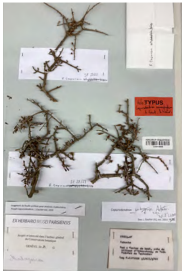
Fig. 4. Capurodendron nanophyllum , the species with the smallest leaves in the Sapotaceae. Described in 2018 as already critically endangered due to deforestation (recovery 99.4 %; labelled as 3 in Fig. 1b)

dramatic loss of biodiversity due to deforestation. From the 995 samples, 70 % were extracted from herbarium sheets (oldest 1911, mean 1993, SD 21.4). The kit used was specially design for Sapotaceae (Christe et al. 2021) and targeted 792 regions for a total of >870 000 bp. Lastly, the genus Hyphaene in the Arecaceae family was investigated in order to define its position within the sub-family Coryphoideae and to address species delimitation issues within the genus. Only nine herbarium specimens out of 124 samples were used (oldest 1875, mean 1959, SD 50.5) but they represent valuable samples. The kit used targeted 916 regions for a total of >1 500 000 bp (Loiseau et al. 2019).