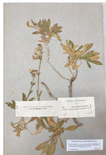
Fig. 2. Silene lagunensis , collected in 1906 in the Canary Islands (recovery 70.7%; labelled as 1 in Fig. 1b).